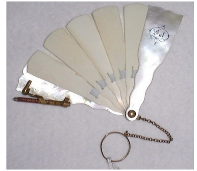
Fan shaped dance card- Mother of Pearl front and back, "Bal" engraved on the front; ; held together by a clip and has a place for a pencil in gold tone; inside are 6 pages made of very thick ivory (ivorylet) and the pages are held together with a blue silk ribbon; 3 1/2" long. C 1850-1880