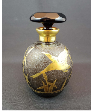
A Cologne, circa 1957, from Fuger Taube of West Germany. It is acid cuback smoke colored glass with geese and cattails decoration in gold enamel. 5 inches tall.