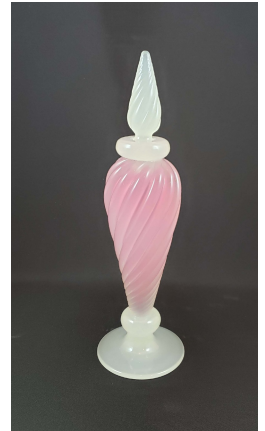
Last is a cologne by Archimede Seguso of Murano, for DeVilbiss circa 1965. Pink alabastro body in a twist or swirl pattern with white alabastro stopper and foot. 10 inches to top of stopper.