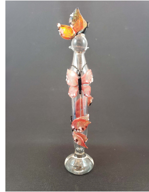
This is a dropper perfume from Loy Allen Glass of South Dakota, 2006. Clear glass bottle with applied butterflies having opaque pink wings with gold highlights and black bodies, including one on the stopper; signed "Loy 2006"; 10 inches