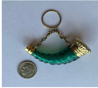
Finger ring hand held traveling perfume bottle in the shape of a horn; turquoise and ribbed all the way from one end to the other; silver mounts on the end and on top; ring held by a silver chain; beautiful scrolling on the lip of silver; glass stopper; snaps open; 2" long. C 1850-1880