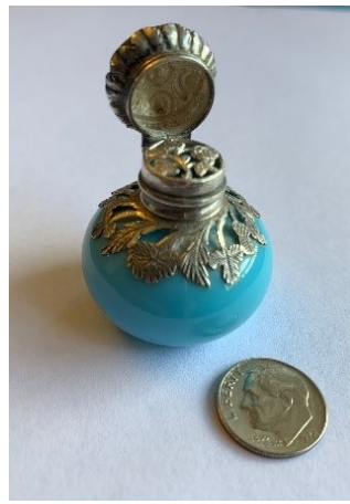
Victorian Vinaigrette; oval powder blue opaque glass with silver around the neck, collar and lid also inside for the grate; the silver mountings are in a leaf motif and the top is in round swirlies; grate is made of leaves; top flips open; 1 1/2" tall. C 1850-1880