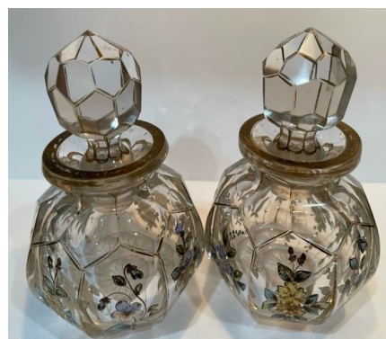
Susie's second share were these extremely heavy, thick perfumes purchased from England.